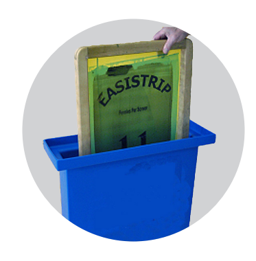
3. DIP SCREENS (1-3 MINS OR UNTIL FILM LOOSENS FROM MESH)