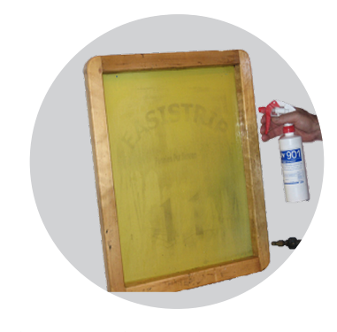
5. SPRAY EASIWAY STAIN REMOVER