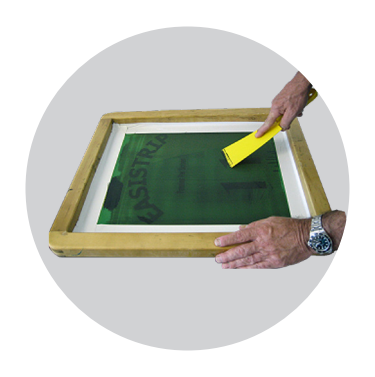
1. SCRAPE INK