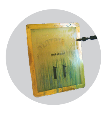
4. PRESSURE RINSE