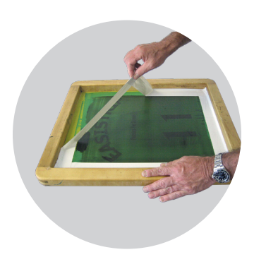
2. PULL TAPE